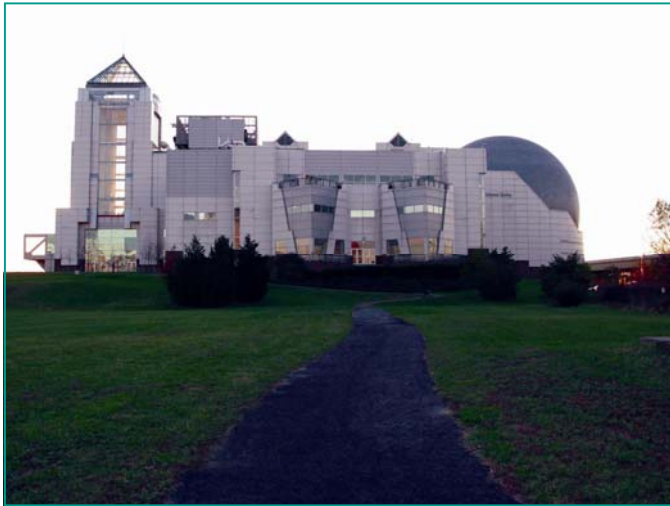
▲ LIBERTY SCIENCE CENTER in Jersey City.